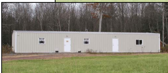
MANCHESTER COMMUNITY ASSOCIATION LIBRARY & BALL FIELD