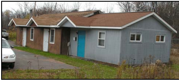
Manchester Township Building