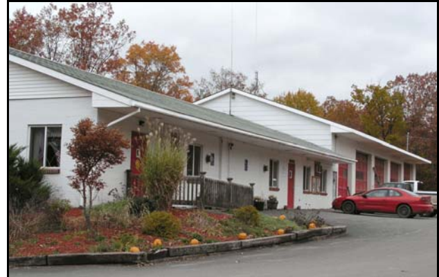
Damascus Township Building